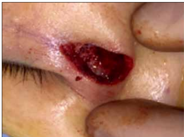
Figure 2. Hemostasis is achieved with bone wax and direct compression.