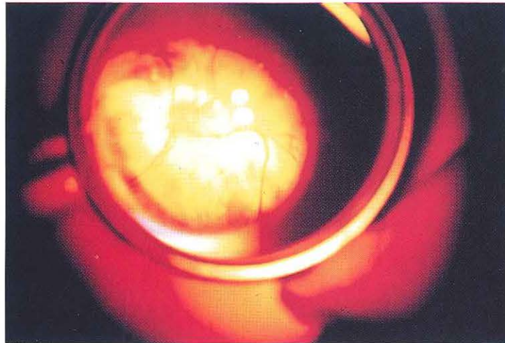
Figure 2. Four weeks postoperative photograph showing attached retina in the posterior pole (indirect ophthalmoscopic view).

opposite sclerotomy was pulled close by the assistant, using the sutures that were already in place. Similarly the infusion cannula was withdrawn while the preplaced knot was pulled tight by the assistant. Permanent knots were then placed. This manoeuvre helped in avoiding globe collapse. The conjunctiva was closed with a 7-0 vicryl suture. No attempt was made to drain the subretinal fluid and no peripheral buckle was placed. No air was injected in to the eye. Postoperatively topical steroid was used every hour for 3-4 days and then tapered. A mild mydriatic was also used. Four weeks postoperatively examination was done under general anaesthesia to evaluate the retina as well as the intraocular pressure.